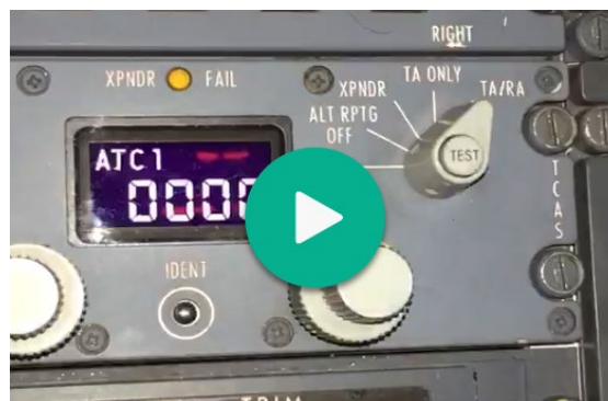
Short awareness video on TA-only operations