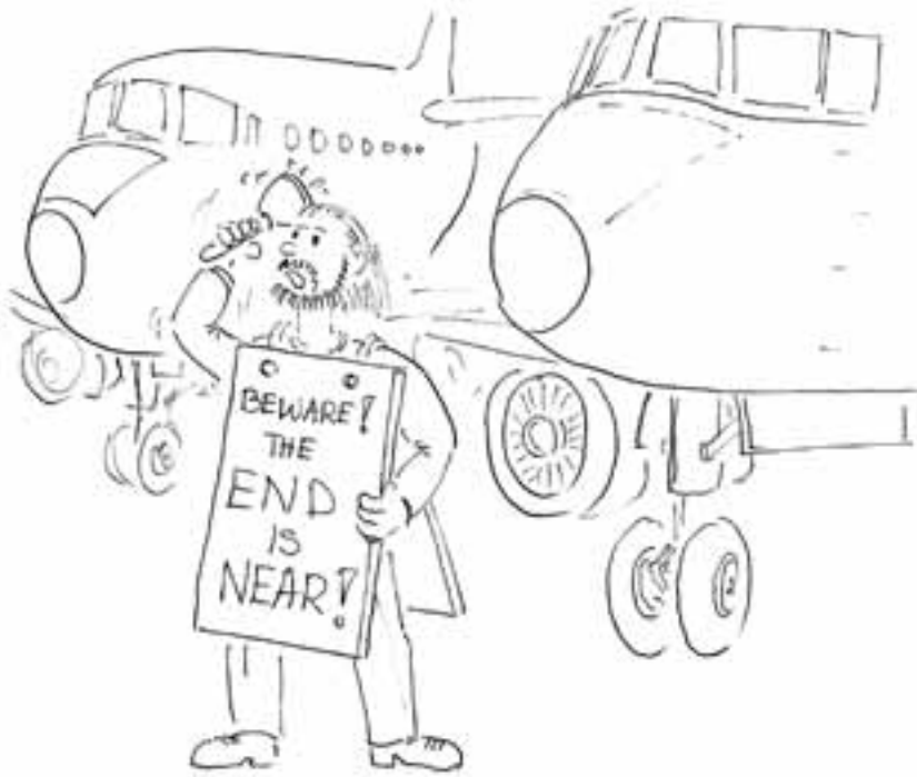
Oh, him? He's part of the awareness campaign about the reduced RWY length...