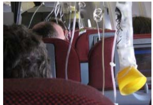
Figure 1: Passenger oxygen masks

systems at the altitudes typically attained during cruise.