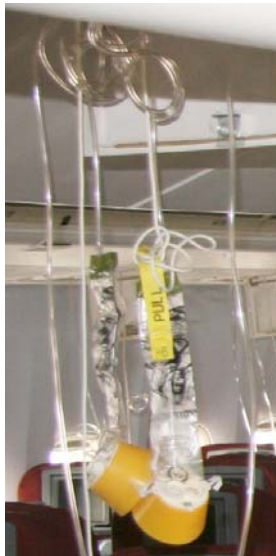
Figure 3: Pull down mask to start the flow of oxygen

Procedures for flight crew involve firstly donning their own oxygen masks and then working through a checklist. The flight crew are unlikely to have time to make an announcement to the cabin. If necessary, the flight crew will immediately commence a descent to 10,000 ft or to the lowest safe altitude that terrain permits. The aircraft's supplemental oxygen supply is finite, so any delay in commencing the descent to a safe breathing altitude may increase the risk of injury to crew and passengers. A rapid descent also minimises the time passengers and crew are exposed to cold temperatures and minimises the risk of decompression sickness (see page 6).